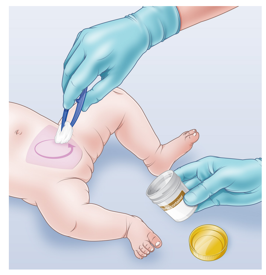
Fig 1 | Quick-Wee voiding stimulation method of gentle cutaneous suprapubic stimulation using gauze soaked in cold fluid.

Standardised urogenital cleaning for both groups was performed using a designated standard cleaning pack with 10 mL sterile water ampoules at room temperature. Additional suprapubic cutaneous stimulation was done using a designated pack containing disposable plastic forceps and gauze, and study labelled ampoules with 10 mL of cold 0.9% saline. The cold fluid was stored in a designated study refrigerator with a monitored temperature of 2.8°C. Clinicians were advised to start using the cold fluid within two minutes of removal from the refrigerator to ensure it remained as close as possible to the designated temperature.